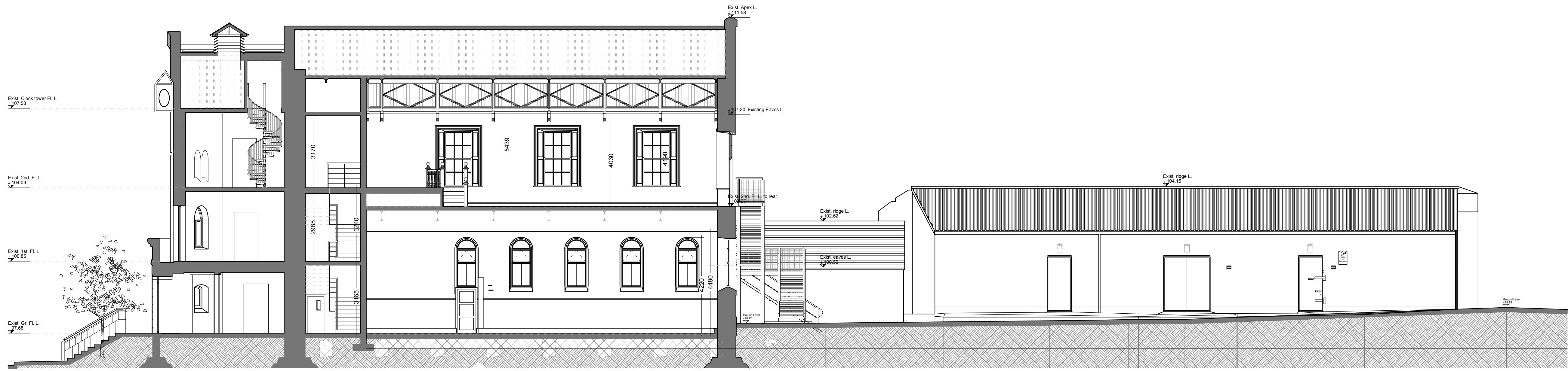
1 SECTION B-B SCALE 1:100