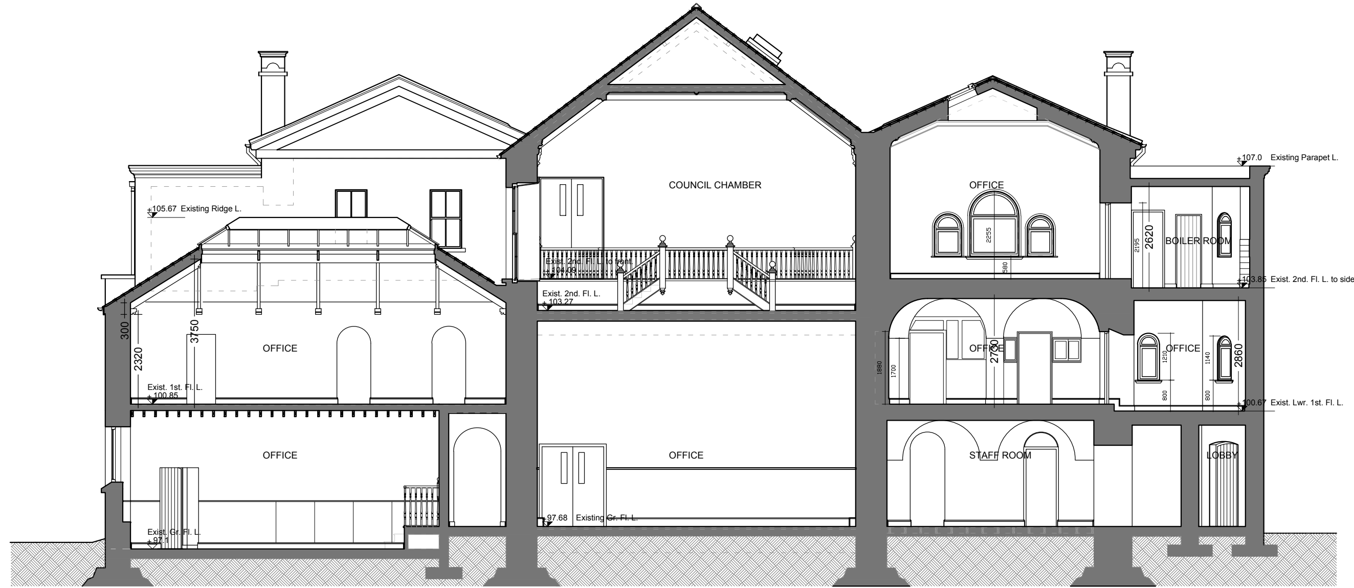
2 SECTION A-A SCALE 1:100